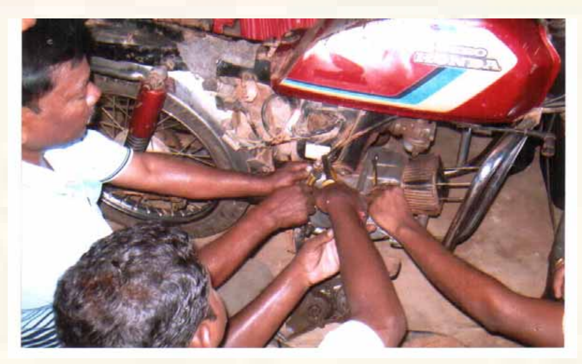
Two Wheeler Mechanism Training Programme